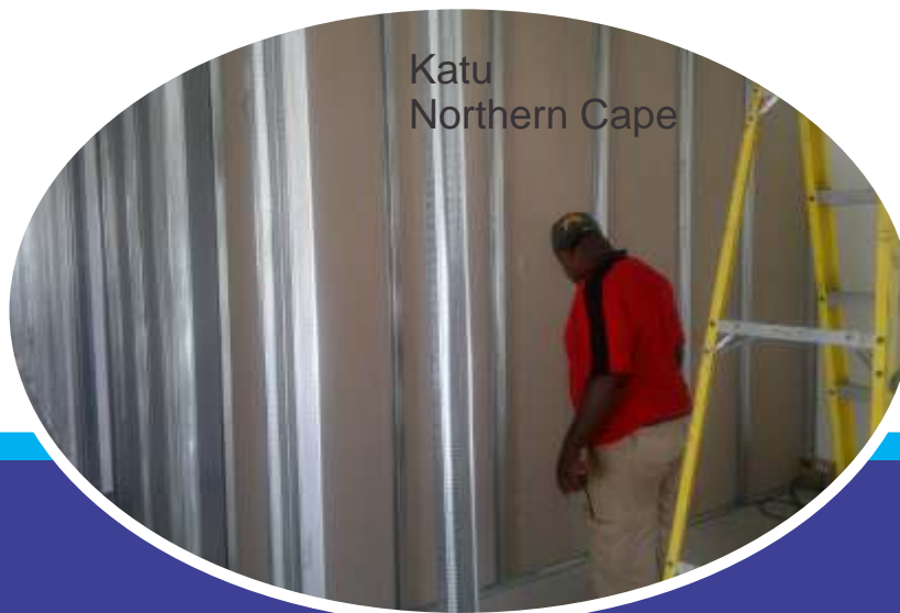
Katu Northern Cape

We have created a partnership with our suppliers to enable us to continually offer our customers the best quality and value. Promoting and maintaining our companies and staffs' development, which contributes to our success.