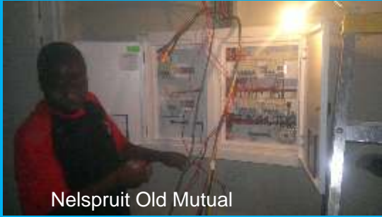
Nelspruit Old Mutual