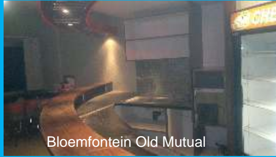
Bloemfontein Old Mutual