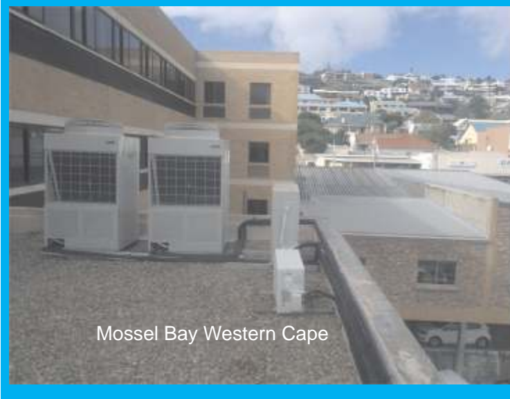
Mossel Bay Western Cape