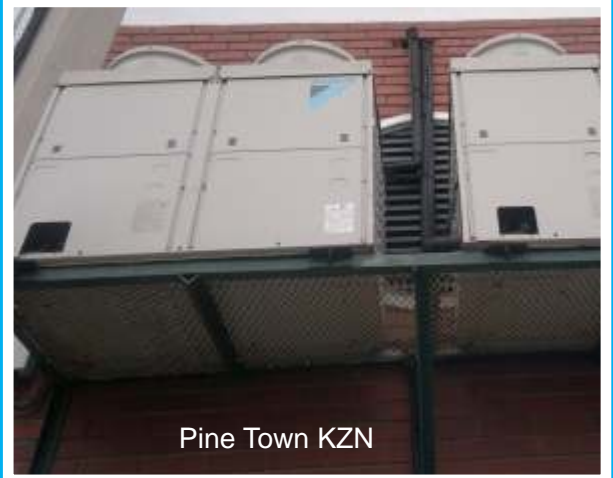
Pine Town KZN

With a history of numerous successfully completed projects, our experience encompasses nearly every major discipline of electrical contracting. The ability to network with a multitude of local and national sub contractors and design professionals is just another reason to choose BIP for your next project , irrespective of how big or small.