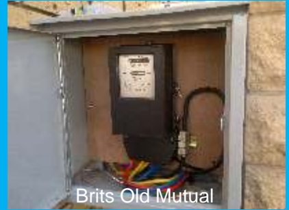
Brits Old Mutual